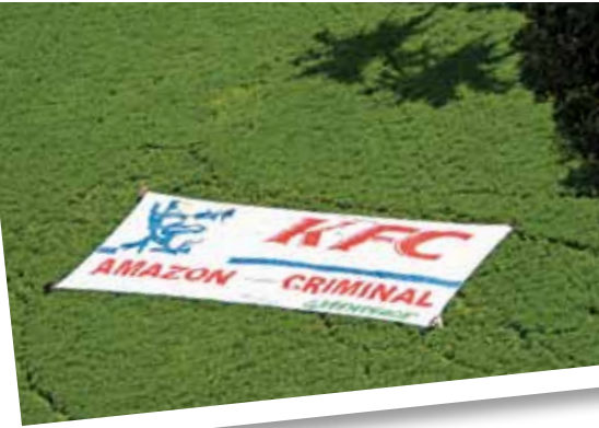
Greenpeace highlights links between KFC and deforestation for soya in the Amazon, 2006.