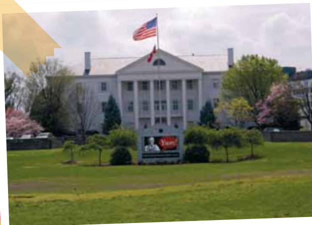
Yum! Brands and KFC International head office, Louisville, Kentucky, USA.