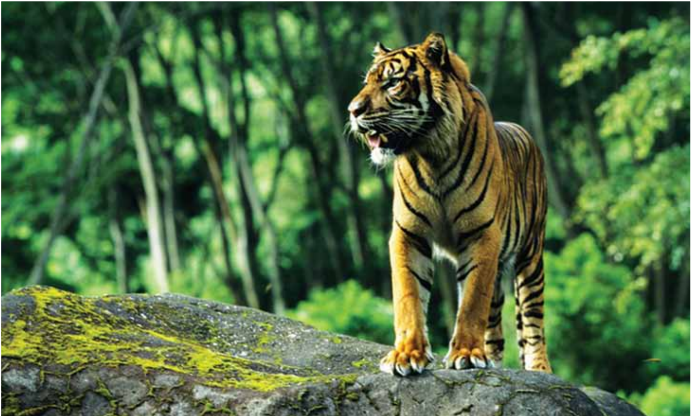
A Sumatran tiger ( Panthera tigris sumatrae ).