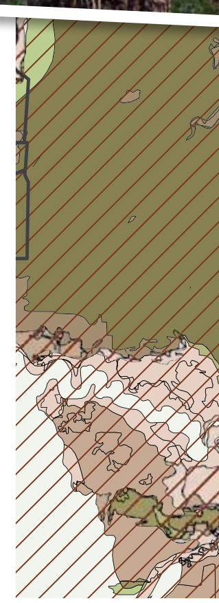
1. Rainforest clearance in PT MSK, an Asia Pulp and Paper (APP) supplier concession, February 2012