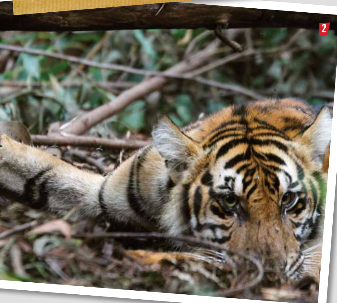
2. An endangered Sumatran tiger, found trapped in an acacia plantation belonging to Arara Abadi, a supplier to APP in Pelalawan District in July 2011. Rainforest mapped as tiger habitat was being cleared in this same area. Tragically a rescue effort failed and the tiger later died.

Some of the rainforest fibre identified in KFC packaging is coming from APP mills which are fed from cleared Sumatran tiger habitat. KFC and its parent company Yum! are therefore helping to drive the Sumatran tiger closer to extinction.