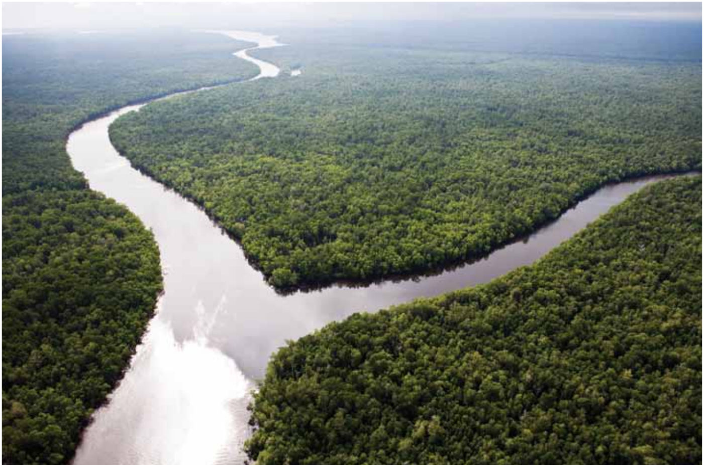
Peatland swamp forest in Sumatra.