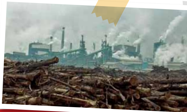
Stockpiles of logs at APP's Indah Kiat Perawang pulp mill.